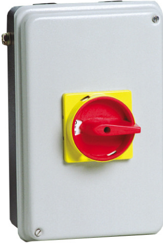
32A - 63A